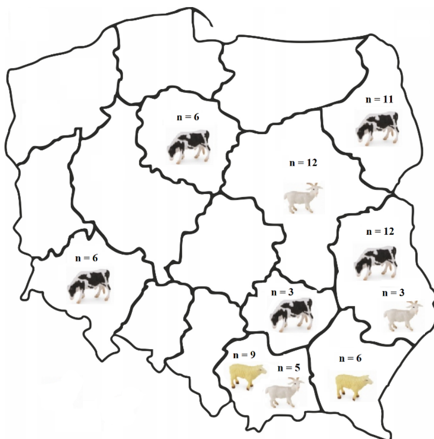
Fig. 1. Map of Poland showing sampling points in different voivodeships

Analytes of interest. Fourteen PFASs were investigated: perfluorobutanesulfonic acid (PFBS), perfluoropentanesulfonic acid (PFPeS), PFHxS, perfluoroheptanesulfonic acid (PFHpS), linear and branched PFOS (l-PFOS and br-PFOS), perfluorohexanoic acid (PFHxA), perfluoroheptanoic acid (PFHpA), PFOA, PFNA, perfluorodecanoic acid (PFDA), perfluoroundecanoic acid (PFUnDA), perfluorododecanoic acid (PFDoA), perfluorotridecanoic acid (PFTrDA), and perfluorotetradecanoic acid (PFTeDA).