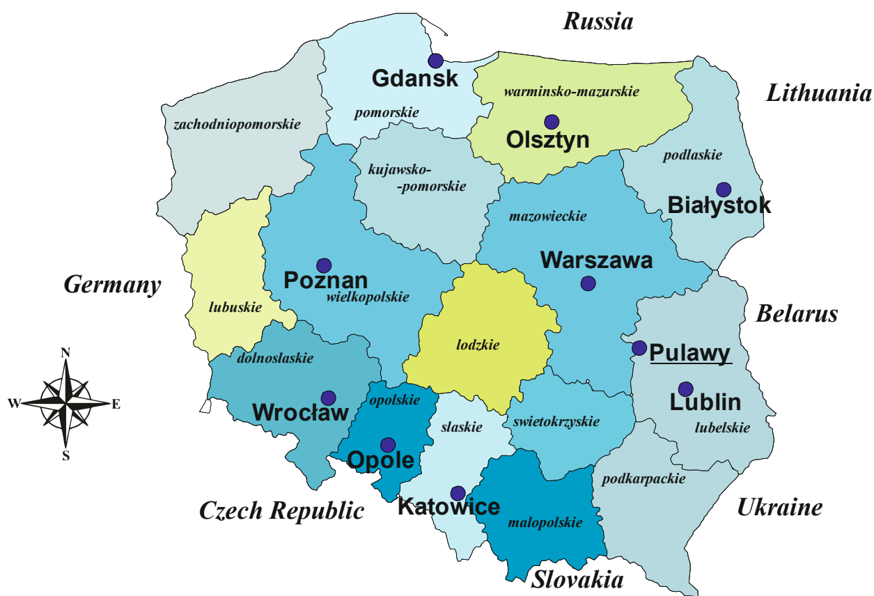
Fig. 1. Map showing the sampling area

Research material. A total of 1,416 samples of food of animal origin were tested: 793 land animal muscle samples (from cattle, sheep, pigs, poultry and game), 195 fish muscle samples, 193 chicken eggs, and 235 milk and dairy product samples (including raw milk, cheese, milk powder and whey), as summarised in Table 1.