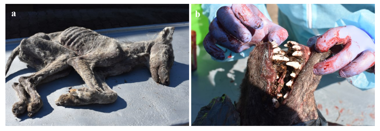
Fig. 3. External inspection of a wolf carcass showing: a - advanced alopecia; hyperkeratosis; emaciation and severe dehydration and anaemia; b - presence of soil and fragments of vegetation in the mouth suggestive of some neurological symptoms, which were nevertheless ruled out by a negative rabies test result

Necropsy findings. The observed clinical signs in the female wolf found dead, which was estimated to be 2 years old (born in 2020), included alopecia of the entire body, hyperkeratosis, emaciation and dehydration, anaemia of the mucous membranes (Fig. 3a), presence of soil and fragments of vegetation in the mouth (Fig. 3b), a stomach with little digestive content, empty intestines,