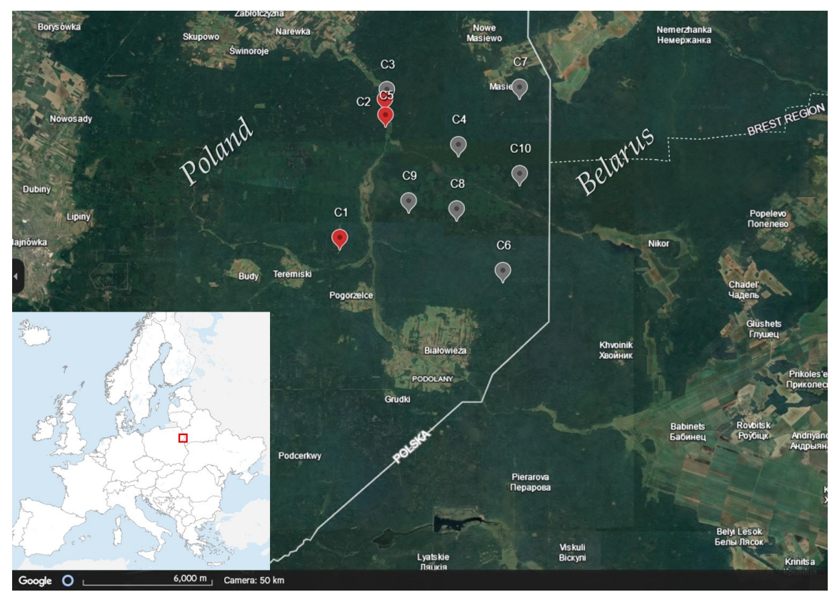
Fig. 1. The distribution of camera traps (C1–C10, Table 1) installed for the monitoring of mange cases in wolves in the Białowieża National Park in winter 2021/2022. Red tags – locations where severely alopecic wolves were observed. Red square in the bottom left corner map – the location of the BNP in Europe

Field observations. The camera surveillance (Table 1, Fig. 1) tracked five wolves with severe alopecia of the entire body (Fig. 2). In addition, border guards (Fig. 2a) and forest rangers (Fig. 2b) also observed alopecic wolves, some of which may have been the same individuals. All the mangy wolves were young, 1-2 years old, and were mostly wandering alone (Supplementary Video S1). Two of them had used haystacks in mid-forest meadows left for European bison and cervids as their shelters instead of the burrows used by other pack members. Skin lesions indicative of Sarcoptes infestation of low to moderate severity were also observed on several other wolves in the BNP (Supplementary Video S2).