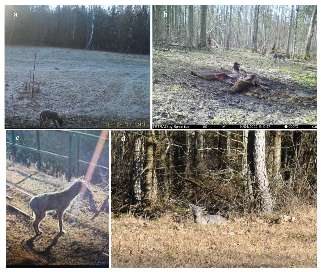
Fig. 2. Observations of severely alopecic wolves in Białowieża National Park: a - camera trap image of the wolf found dead a day later (Table 1, C1 and Fig. 3); b - camera trap image from the camera positioned on a European bison carcass (Table 1, C4); c - photo taken by a Polish border guard on the border with Belarus on the bridge over the Narewka river (Kosy Most; 52.7996N, 23.8284E) near location of trap C2 (Table 1); d - photo taken by a forest ranger in the same midforest meadow as trap C1 (Table 1)