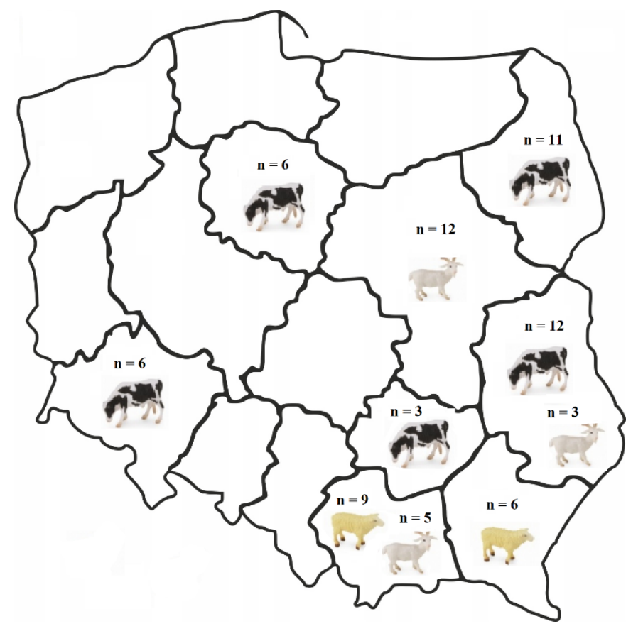
Fig. 1. Map of Poland showing sampling points in different voivodeships

Analytes of interest. Fourteen PFASs were investigated: perfluorobutanesulfonic acid (PFBS), perfluoropentanesulfonic acid (PFPeS), PFHxS, perfluoroheptanesulfonic acid (PFHpS), linear and (1-PFOS branched PFOS and br-PFOS), perfluorohexanoic acid (PFHxA), perfluoroheptanoic acid (PFHpA), PFOA, PFNA, perfluorodecanoic acid perfluoroundecanoic acid (PFDA), (PFUnDA), perfluorododecanoic acid (PFDoA), perfluorotridecanoic acid (PFTrDA), and perfluorotetradecanoic acid (PFTeDA).