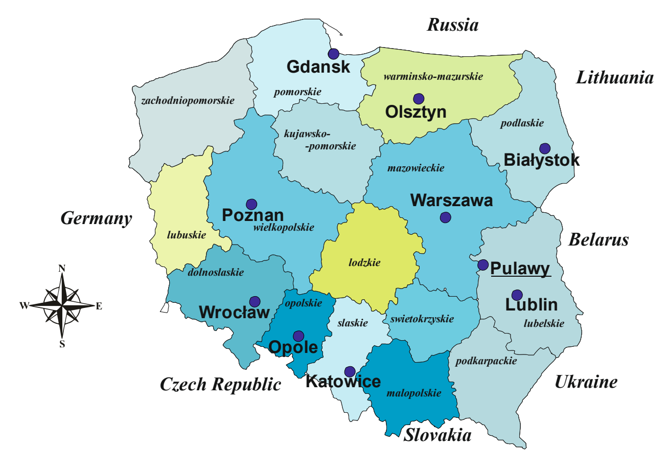
Fig. 1. Map showing the sampling area

Research material. A total of 1,416 samples of food of animal origin were tested: 793 land animal muscle samples (from cattle, sheep, pigs, poultry and game), 195 fish muscle samples, 193 chicken eggs, and 235 milk and dairy product samples (including raw milk, cheese, milk powder and whey), as summarised in Table 1.